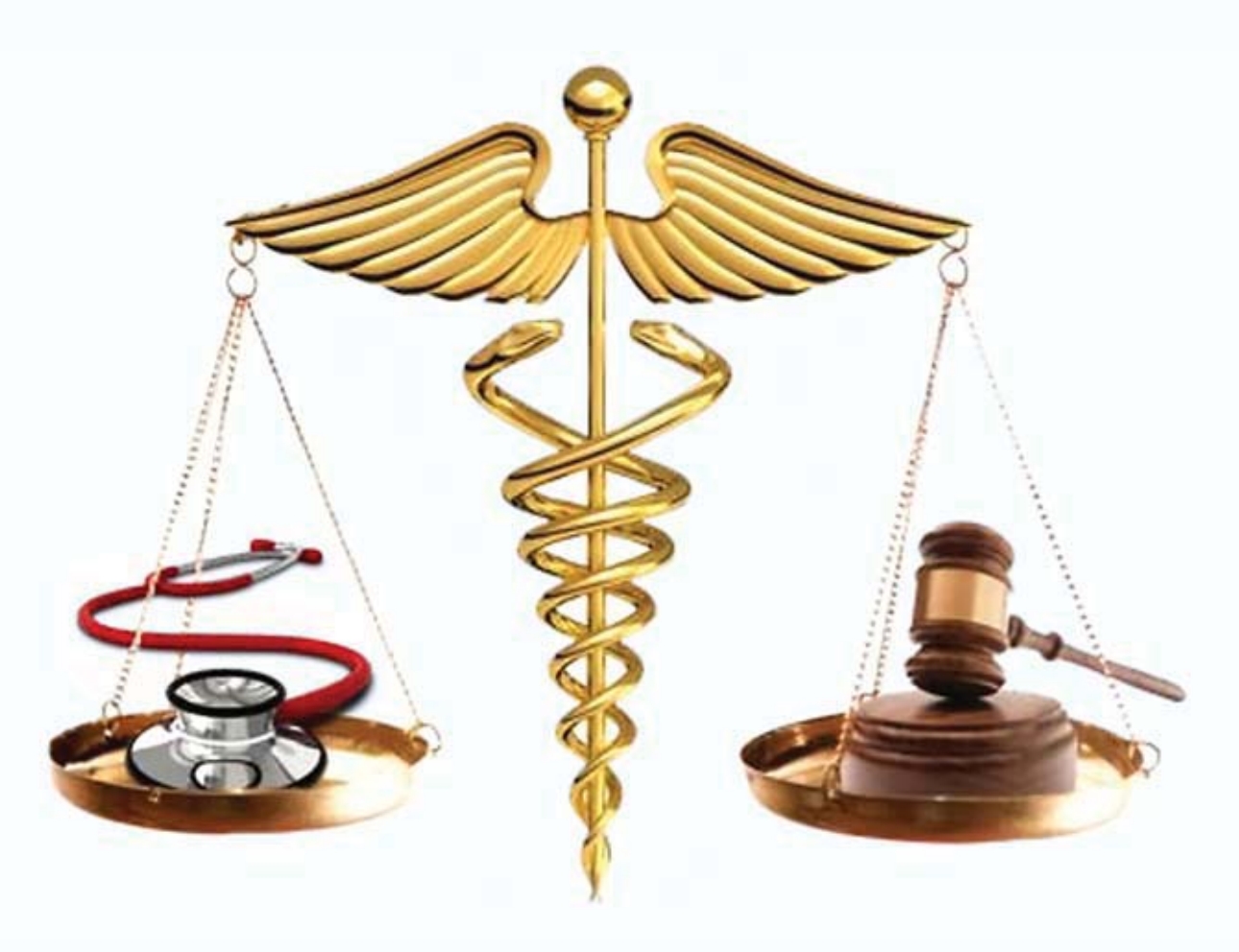
<del>2011</del> <u>2020</u> Edition

"Protection of the Public Shall be the Highest Priority" Business and Professions Code, Section 3710.1